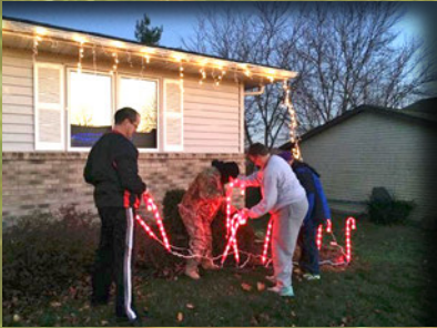
The crew at Nemmers gets a helping hand with their holiday light displays.