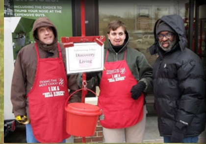
Former housemates reunite to ring in donations for the Salvation Army.