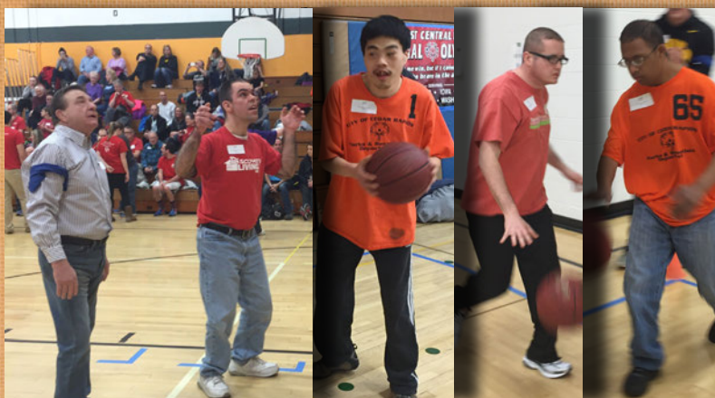
Some familiar faces complete their skills testing at district basketball, this winter.

...worth 1,000 words the quarter in athletics