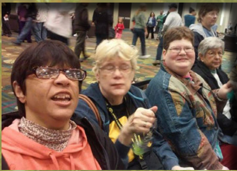
Left: The ladies of Hamer take in the seasonal sights at the annual Christmas tree festival.