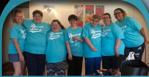
The ladies of Saddleback are primed for a night on the ballfield!

There is nothing like the spirit of sportsmanship and friendly competition to unite friends and fill a day with goodwill and a sense of real accomplishment!