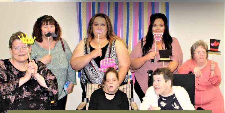
Hamming it up at the Options of Linn County Awards Banquet Photobooth