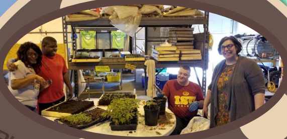
Above: Green-tumbing At right: Shirt-twinning